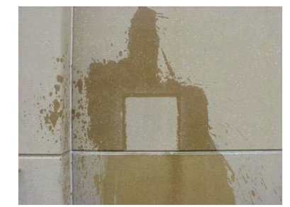
Fig 2. Water sprayed on wall shows the 2'X2' area does not absorb any water

-Warranty Approval: A test is required and must be documented in section 2 of the warranty application. Sections 1 and 2 of the warranty application must be submitted to the manufacturer and approved prior to commencement of full-scale application.